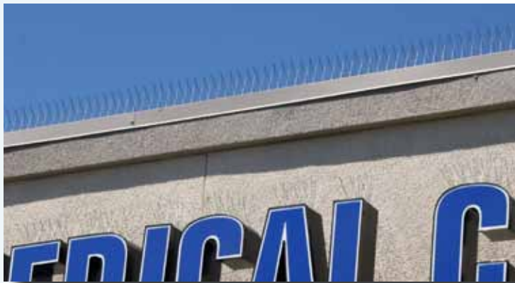
Stainless Steel Bird Spikes installed over channel letters and parapet wall.

Since 1992... The Lowest Cost, Longest Lasting Stainless Steel Bird Spike!