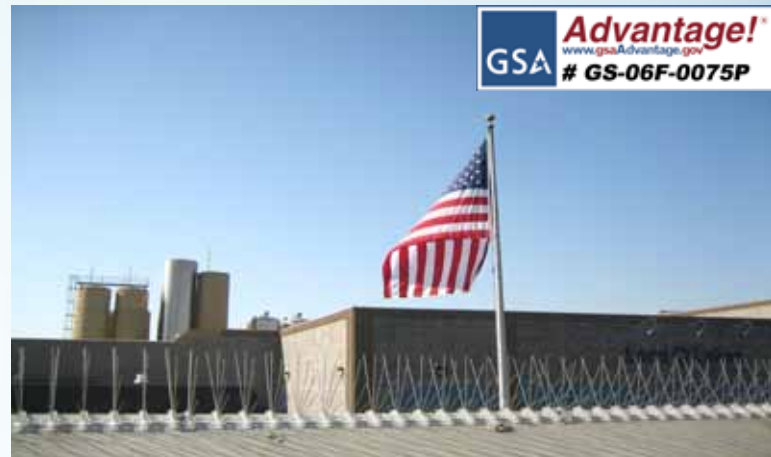
Stainless Bird Spikes installed on a parapet wall.