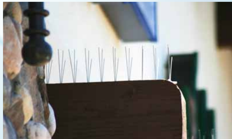
The spikes can be glued, screwed or tied down.