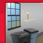
Great for waste management areas