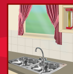
Decorative trap - Hides flies out of view